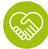
Holistic Leadership Coaching